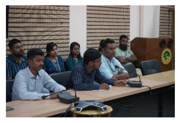
Delivering vote of thank by the scientist.