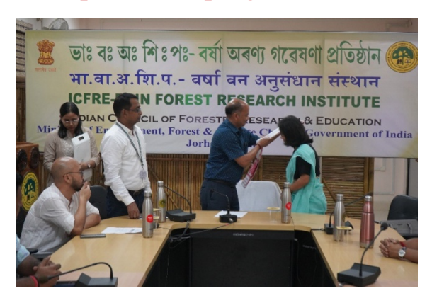
Felicitation of the invited guest by the Group Co-ordinator, ICFRE-RFRI, Jorhat.