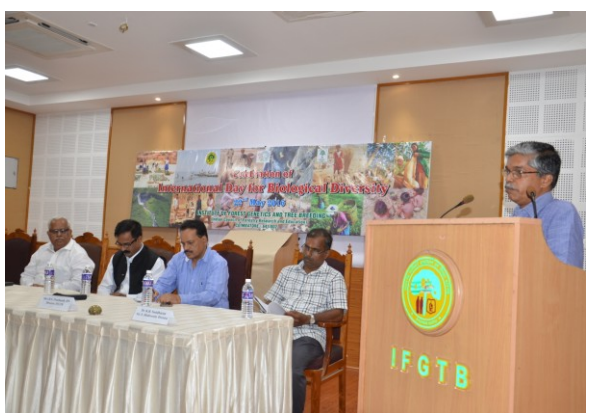
View of the dais