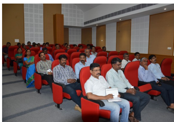
View of audience