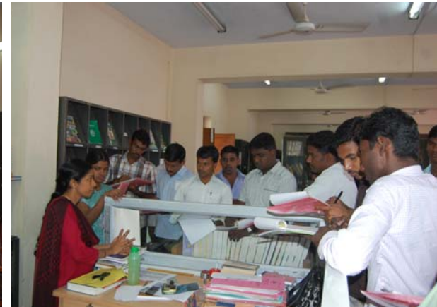
Training in the Library