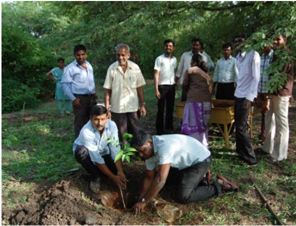
Planting at Botanical Garden