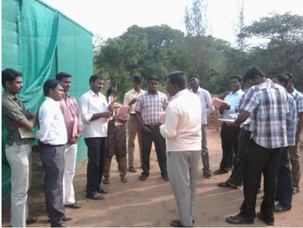
Training at Model Nursery