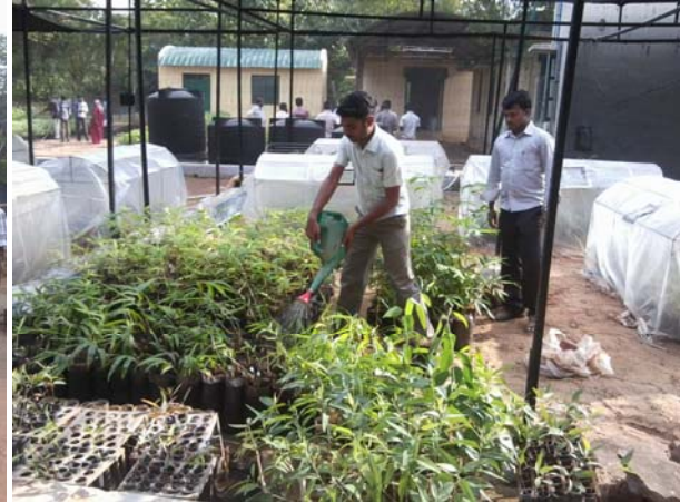
Training at Vegetative Propagation Complex