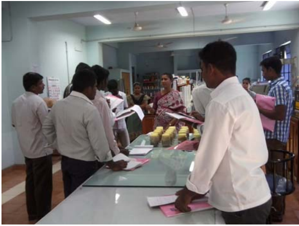
In soil and Water testing lab