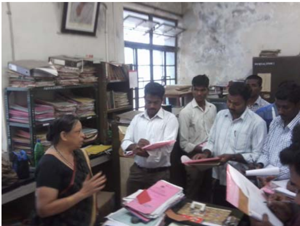
At Stores Section