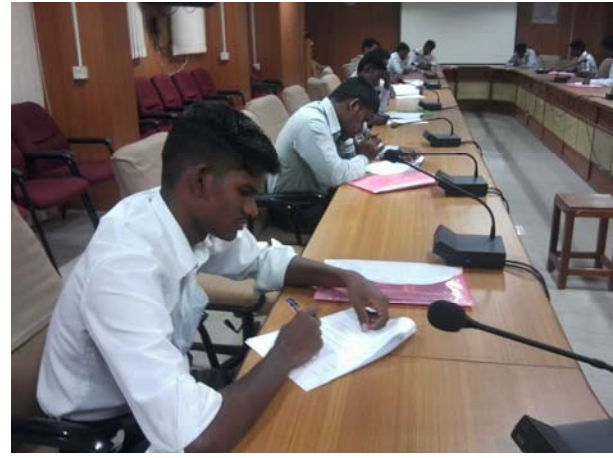
Taking of examination