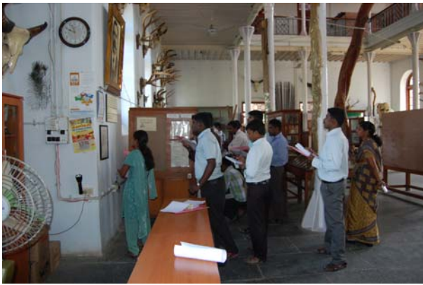
Training at Gass Forest Museum