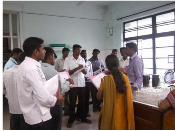
In Pathology Lab