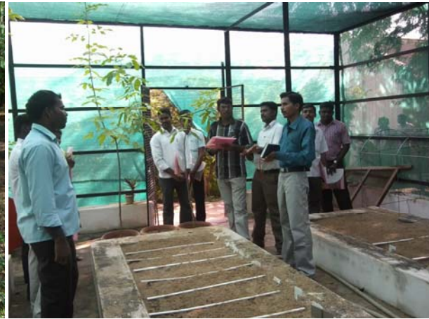
Training at Seed Technology Nursery