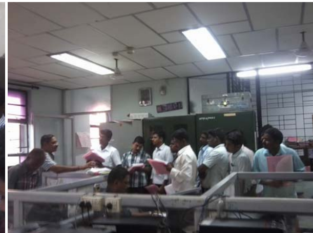
At the Accounts Section