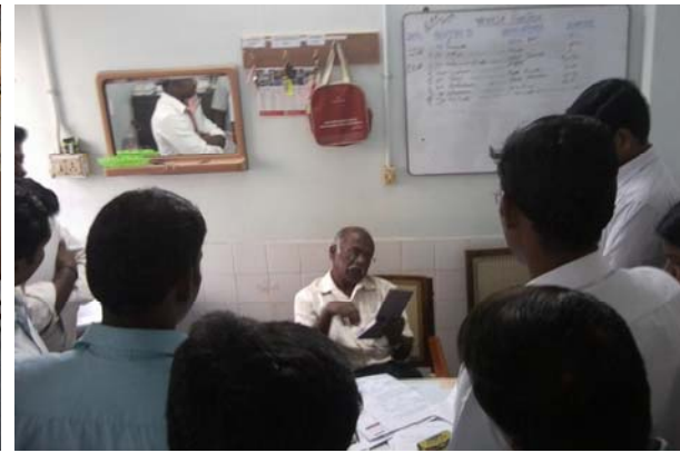
Training in estate management