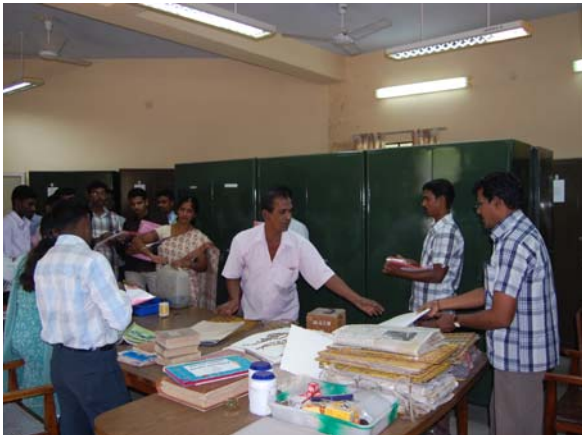
Training at Herbarium