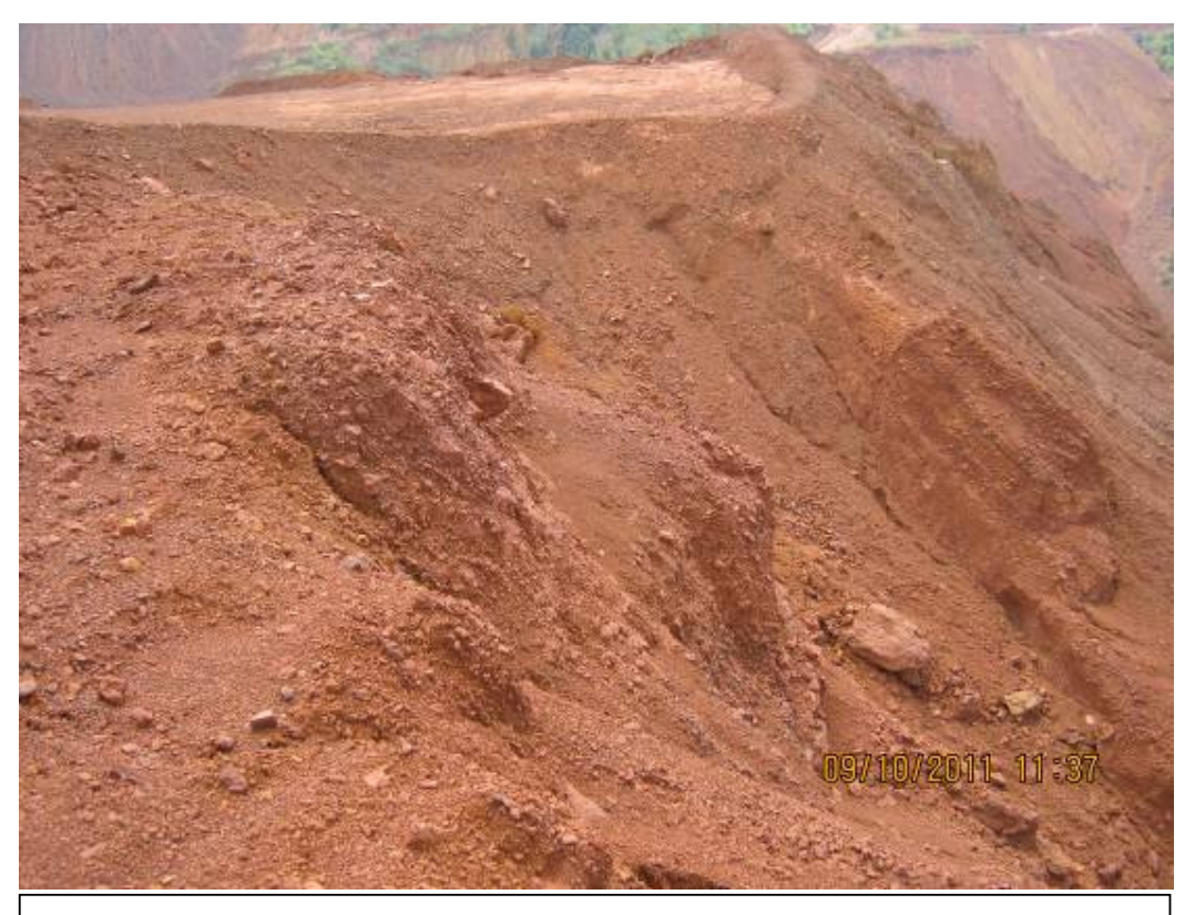
Steep and eroded OB dump of Sri Mahalaxmi mines of Tumkur