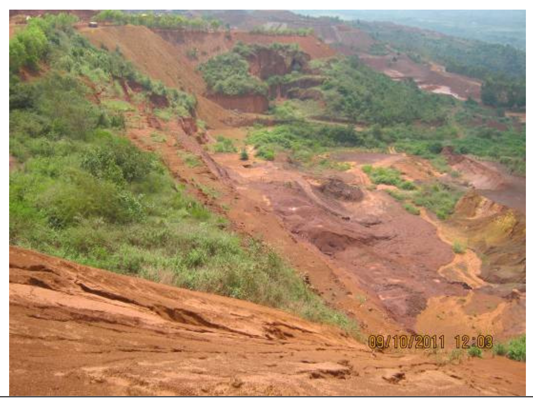
Flowing of silt towards natural nala from unstabilized steep OB dumps of Ganapathi mines of Tumkur