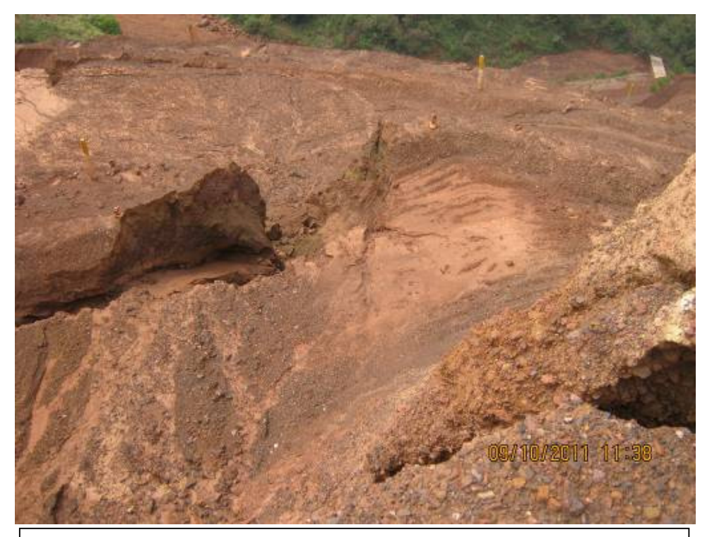
Breaching of OB dump of Sri Mahalaxmi mines of Tumkur