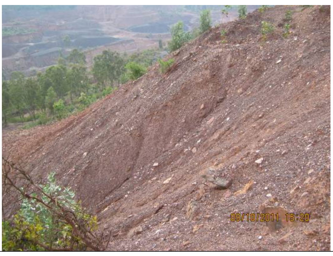
Deep gully formation and erosion of OB dump of Hanuman mines of Tumkur