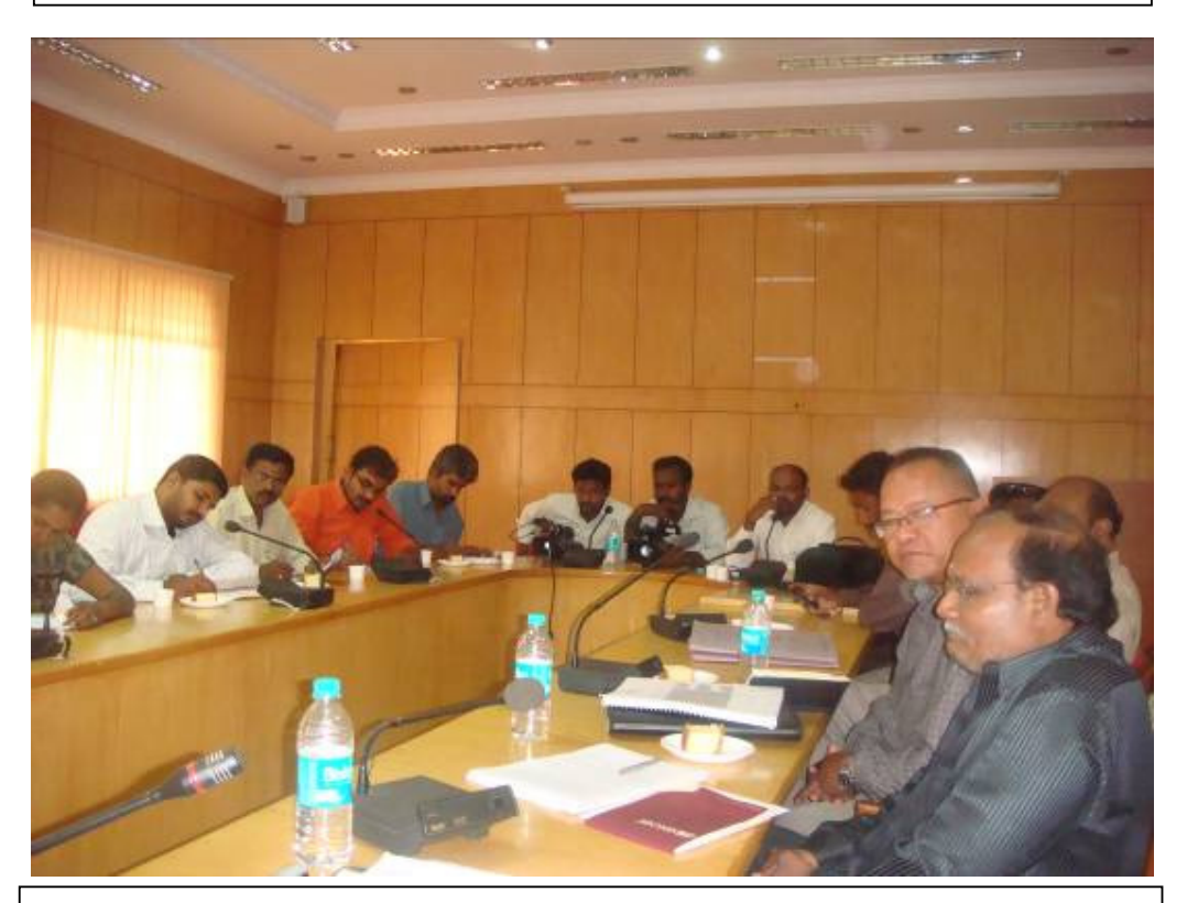
Stakeholders at the meeting of Tumkur