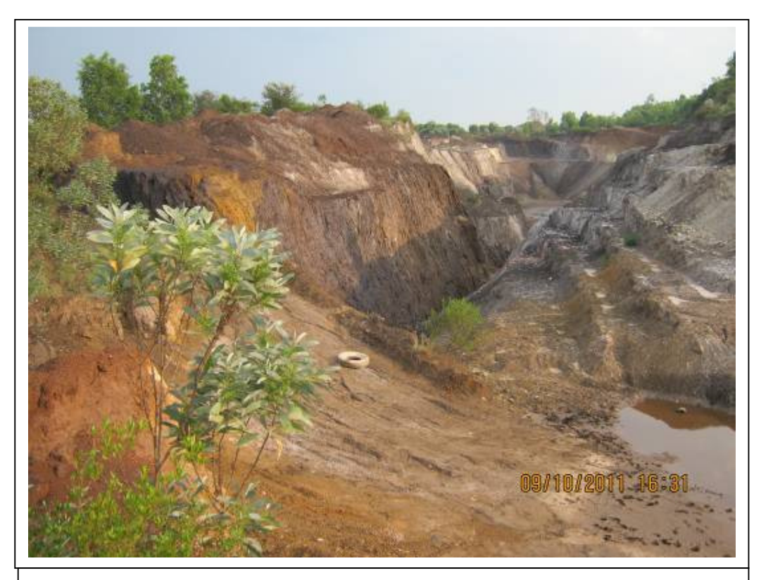
Unscientific mining pit of Jayaram mines of Tumkur