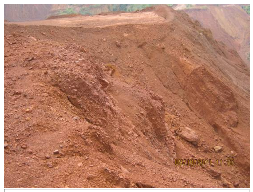
Steep and eroded OB dump of Sri Mahalaxmi mines of Tumkur