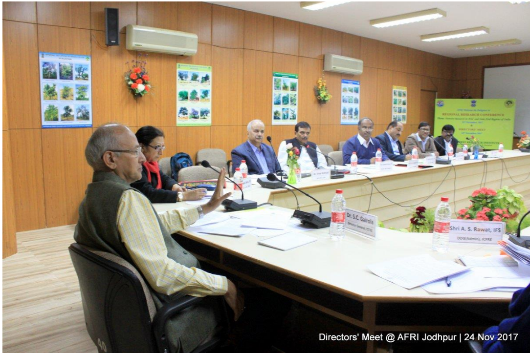
Directors' Meet @ AFRI Jodhpur | 24 Nov 2017