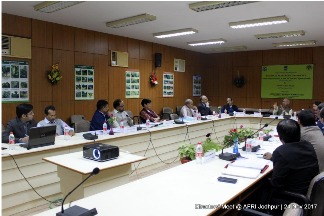
Directors' Meet @ AFRI Jodhpur | 24 Nov 2017