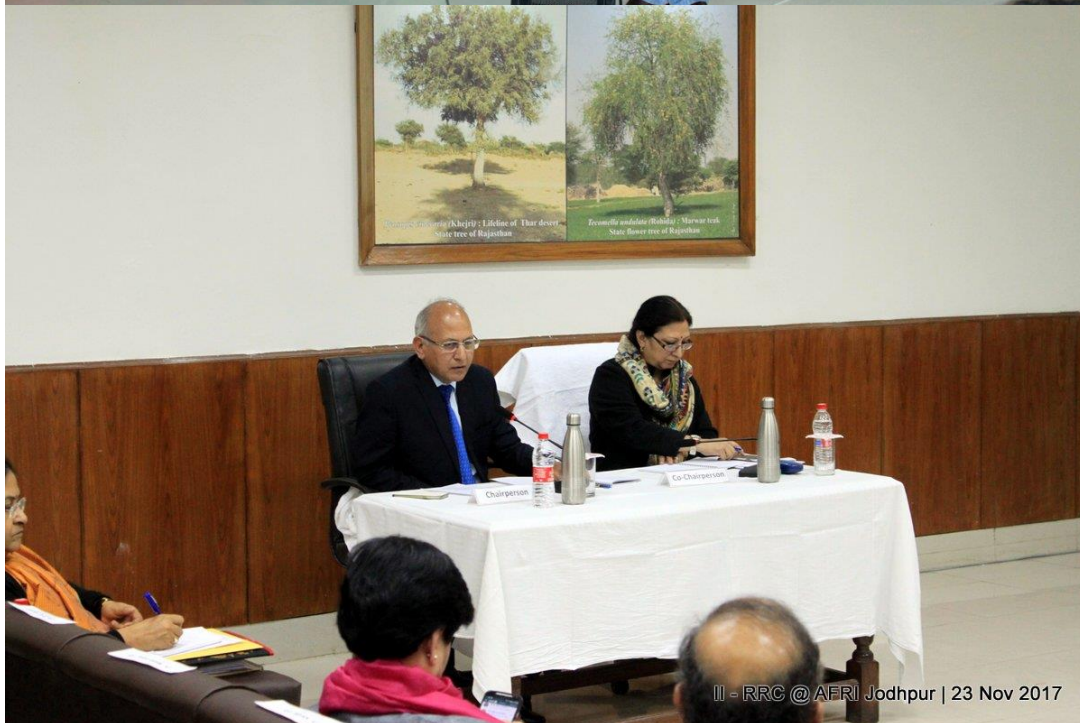
II - RRC @ AFRI Jodhpur | 23 Nov 2017