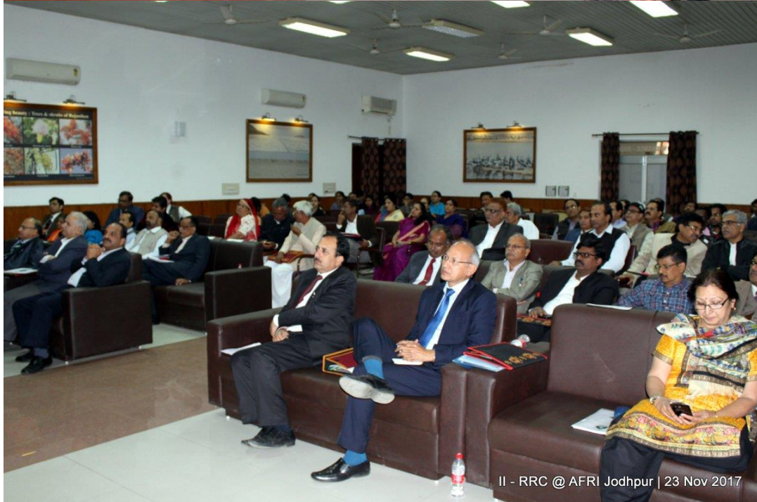
II - RRC @ AFRI Jodhpur | 23 Nov 2017