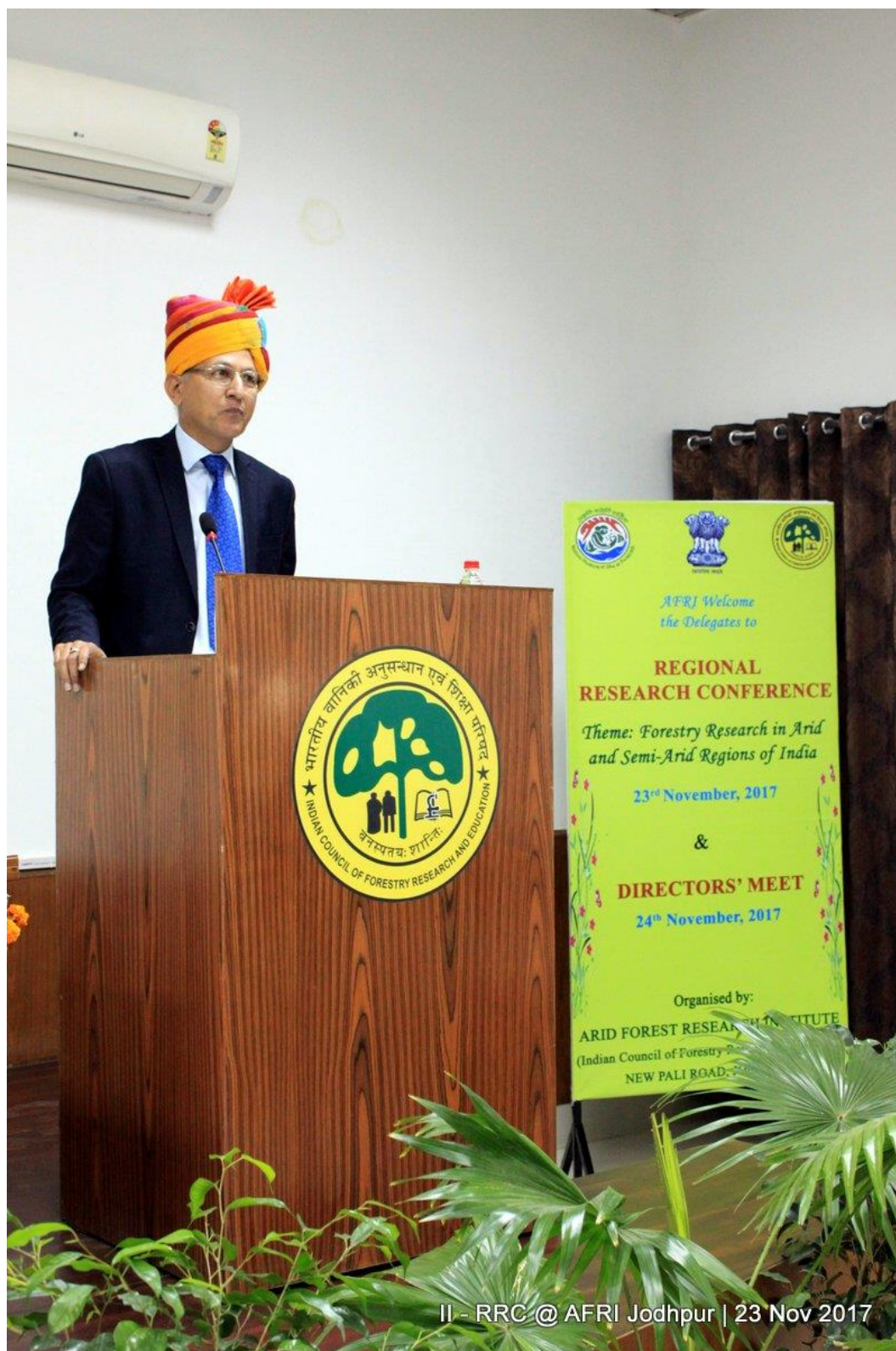
II - RRC @ AFRI Jodhpur | 23 Nov 2017