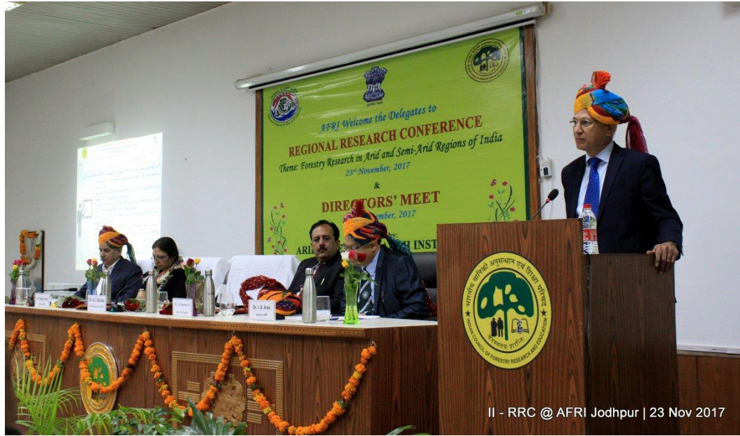
II - RRC @ AFRI Jodhpur | 23 Nov 2017