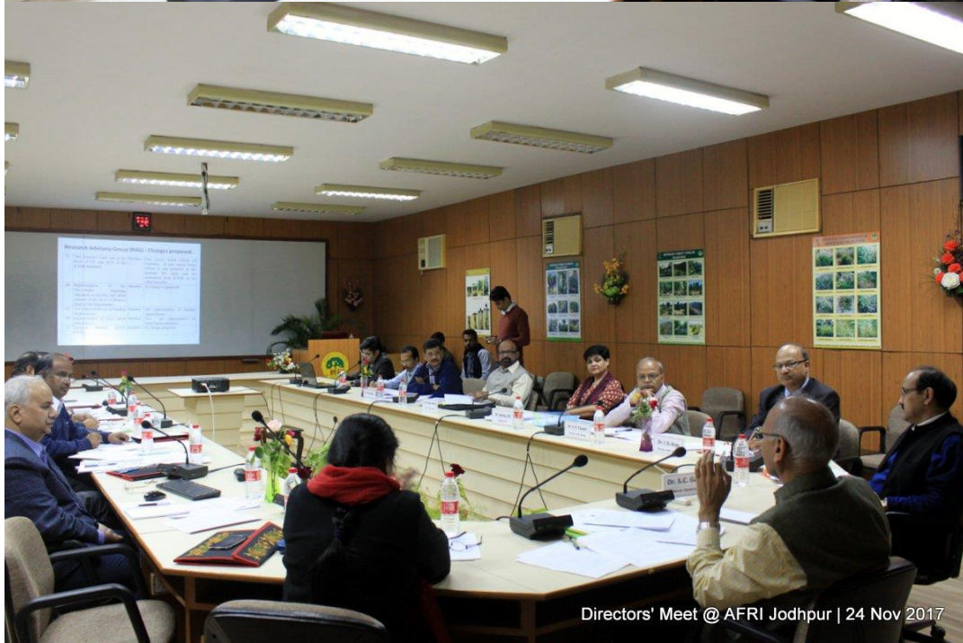
Directors' Meet @ AFRI Jodhpur | 24 Nov 2017