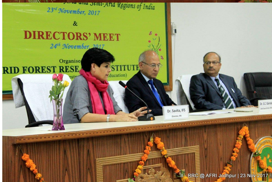
II - RRC @ AFRI Jodhpur | 23 Nov 2017