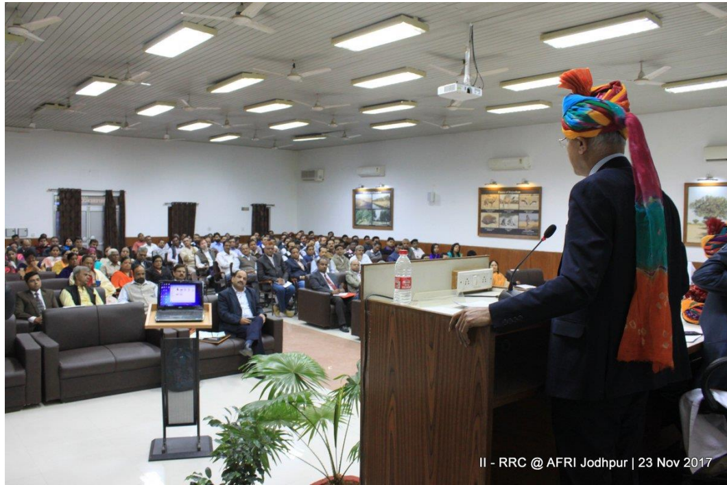
II - RRC @ AFRI Jodhpur | 23 Nov 2017