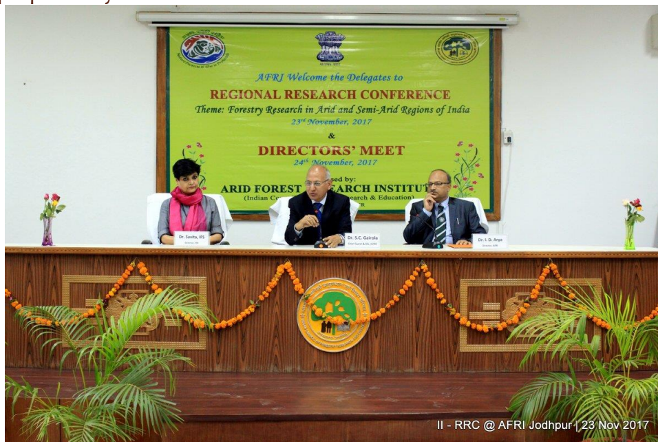
II - RRC @ AFRI Jodhpur | 23 Nov 2017