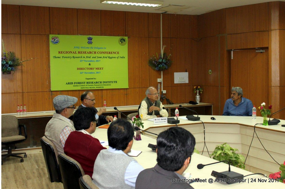
Directors' Meet @ AFRI Jodhpur | 24 Nov 2017