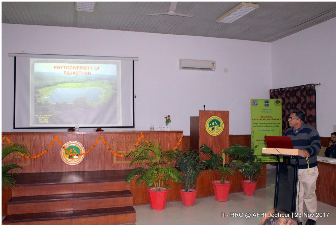
II - RRC @ AFRI Jodhpur | 23 Nov 2017