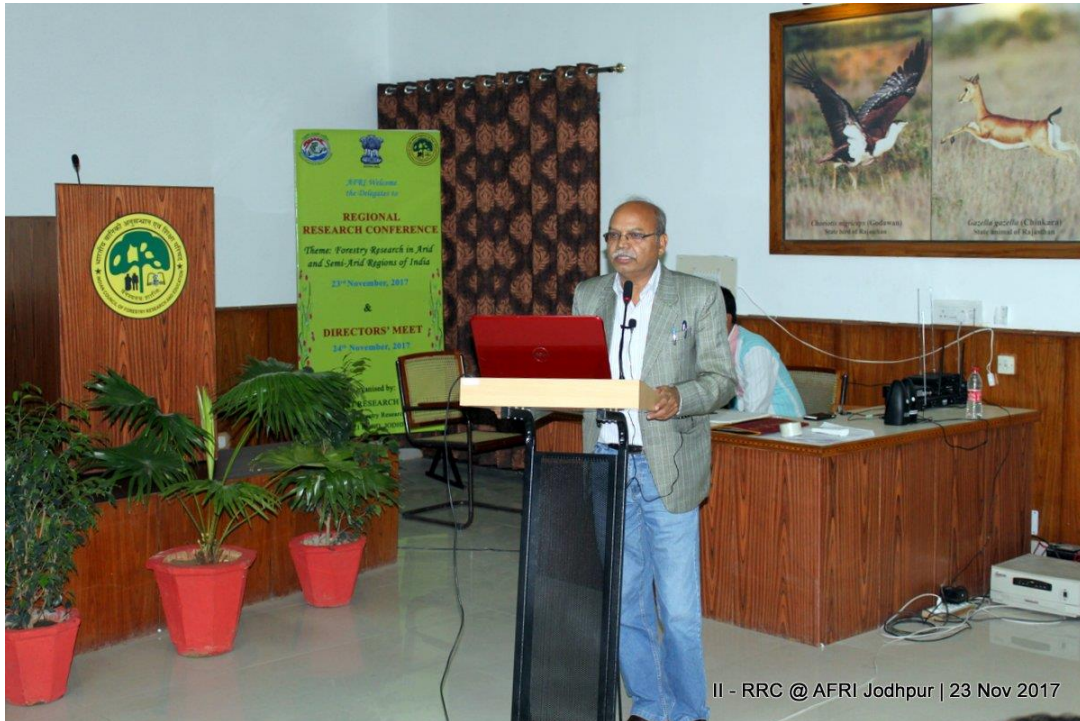
II - RRC @ AFRI Jodhpur | 23 Nov 2017