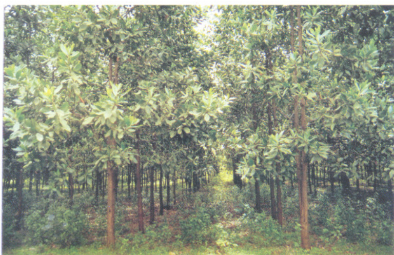
Acacia mangium seedling seed orchard at Nilambur, Kerala (4 years old)

Status: Information on extent and location of existing Acacia mangium plantations were collected from Agricultural Offices/Institutions. Acacia mangium plantations were identified in central and southern agro-climatic zones for further studies.