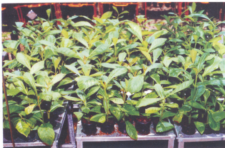
Clonal multiplication of superior trees of teak

Status : Clonal propagation technology for teak has been standardized to produce quality planting stock. The quality seedlings from clonal seed orchard of Maharashtra and Tamil Nadu were also multiplied vegetatively.