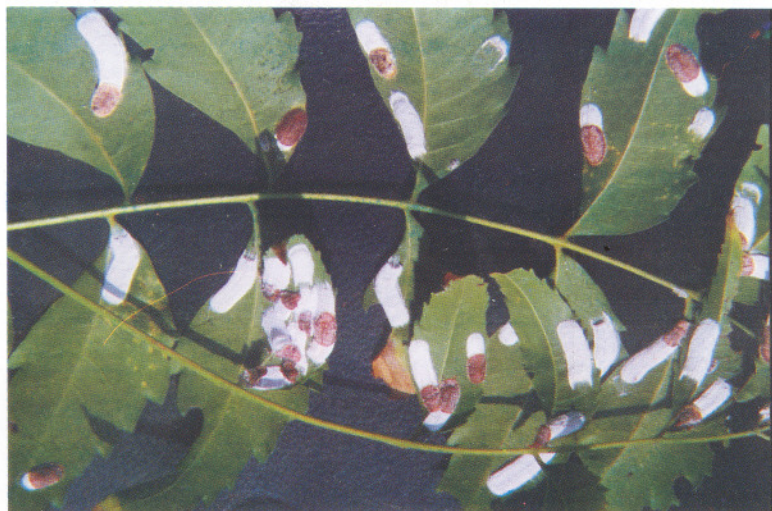
Scale insect, Megapulvinaria maxima attack on neem

Status: Investigation on the pest and disease problems was carried out in modern nurseries in and around Coimbatore. Low to moderate level incidence of Myllocerus sp. (beetle) was observed through out the year on neem, Acacia feruginia , Pongamia pinnata , Embllica officinalis , Casuarina , Cassia , Acacia , Syzygium , Samania saman , Ceiba , teak, Gmelina arborea , Dalbergia latifolia and Sapindus emarginata . Minor incidences of the scale insect, Megapulvinaria maxima on neem seedlings were recorded during April to June and October to December in Coimbatore and Bhavanisagar, respectively. Ferronia limonia seedlings had the infestation of Papilio demoleus during April to June in Coimbatore. Severe attack of Aphis sp. on Embllica in Bhavanisagar was recorded during July to September. Low to moderate incidence of defoliator Achea janta on Tamarind and Ascotis sp. and Delonix regia was also recorded in Coimbatore. Periodical surveys were made to record the incidence of pathological problems and are as follows: