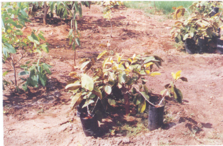
Infected clonal plants of Terminalia chebula by leaf rust disease and the infected plants showed yellowing of foliage.

Powdery mildew: Severe incidence (90%) of powdery mildew on 2 months old tamarind seedlings was observed. However the attack was not severe on seedlings more than six months old. Application of sulphur fungicide (Sulfax @ 0.1% a.i) as well as bio-control agent ( Trichoderma viride and Pseudomonas fluorescence ) as foliar spray were effective against the disease.