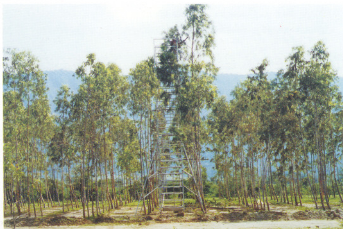
Controlled pollination work in Eucalyptus tereticornis at Sadivayal, Coimbatore

Status: Phenology of flowering and overlapping in Eucalyptus tereticornis , E. citriodora , E. alba , E. grandis , E. robusta , E. globulus , E. resinifera and E. torelliana were studied. A pollen collection was done from species and provenance trial plots.