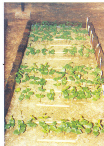
Germination methods for the medicinal plants

Status: Seed extraction, pretreatment and germination methods for the medicinal plants such as Aegle marmelos , Feronia elephantum , Emblica officinalis , Oroxylum indicum , Pterocarpus marsupium , Syzigium cumini , Strychnos nuxvomica and Terminalia bellerica have been standardized. Storage techniques for Aegle marmelos , Feronia elephantum , Emblica officinalis , Oroxylum indicum and Pterocarpus marsupium have been optimized.