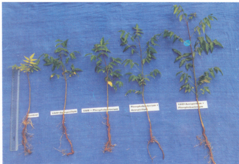
Inoculations of bio-fertilizers to Azadirachta indica

Status: Nursery trials to study the effect of potting media, standardized by various Forest Departments and Forest Development Corporations and the container types and sizes on Acacia nilotica , Acacia leucopholea , Acacia auriculiformis , Albizia amara and Azadirachta indica were completed. Nursery trials to study the effect of different potting media along with bio-fertilizers on teak, Pongamia pinnata , Dalbergia latifolia and Sapindus emarginatus were laid out.