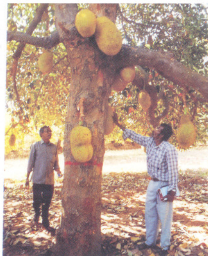
Spreading type of A. integrifolia tree with fruits on main stem, secondary and tertiary branches at Panrutti, Tamil Nadu

Status : Patches of natural population of Artocarpus integrifolia are located in Nilgiri hills (Kothagiria and Barliar), Kolli hills and Valparai. The variations in characteristics of fruits and seeds within populations and between populations have been recorded. Seedlings have been raised in nursery and isozyme characterization has been done to study the genetic structure and variation between populations.