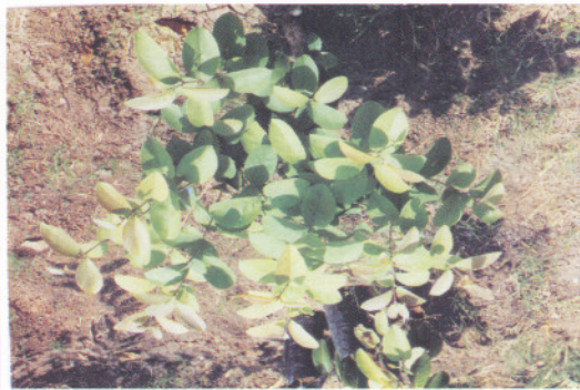
Healthy plants of Terminalia chebula after treatment with the fungicide and bio-control agents.