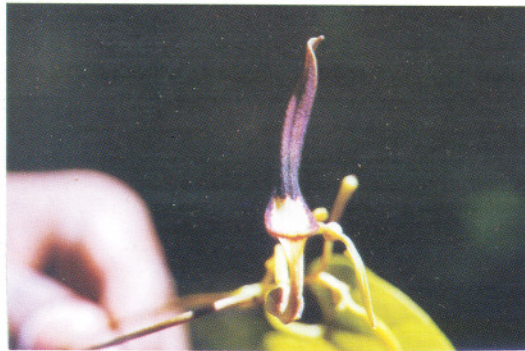
Fully opened flower of A. tagala

Status: Distribution mapping assessment of population status studies on reproductive biology and seed handling techniques of some threatened medicinal plants have been carried out. A total of 124 and 102 woody species including the threatened species were enumerated in surveyed area of Silent valley and Kolli hills, respectively. Regeneration status and population structure of these threatened medicinal plants showed that Myristica dactyloides , Persea macrantha and Garcinia morella showed greater proportion of individuals in lower classes like seedlings, sapling and 10-30 cm girth classe and lesser number in larger girth class. In species like Aphanamixis polystachya , Canarium