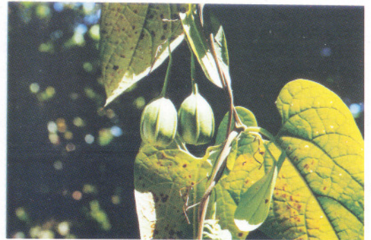
Fruit after 6 months maturation in A. tagala

strictum , Hydnocarpus alpina , Garcinia gummi-gutta , and Cinnamomum sulphuratum seedling or sapling classes are missing. Marked phenological variations exist between plant populations of Aristolochia tagala and Smilax zeylanica . Smilax zeylanica populations flowers during late February in Silent valley and during June and August in Kolli hills.