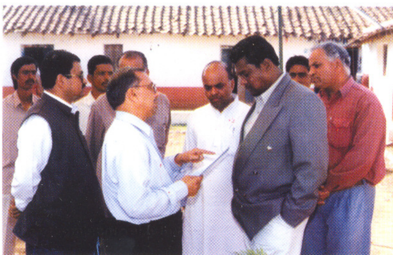
Hon'ble Minister of State, Tribal Affairs Shri Faggan Singh Kulaste interacting during the Farmer's Training at Niwash (M.P.)