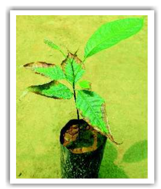
T.viride treated S. macrophylla seedlings showing recovery from anthracnose disease