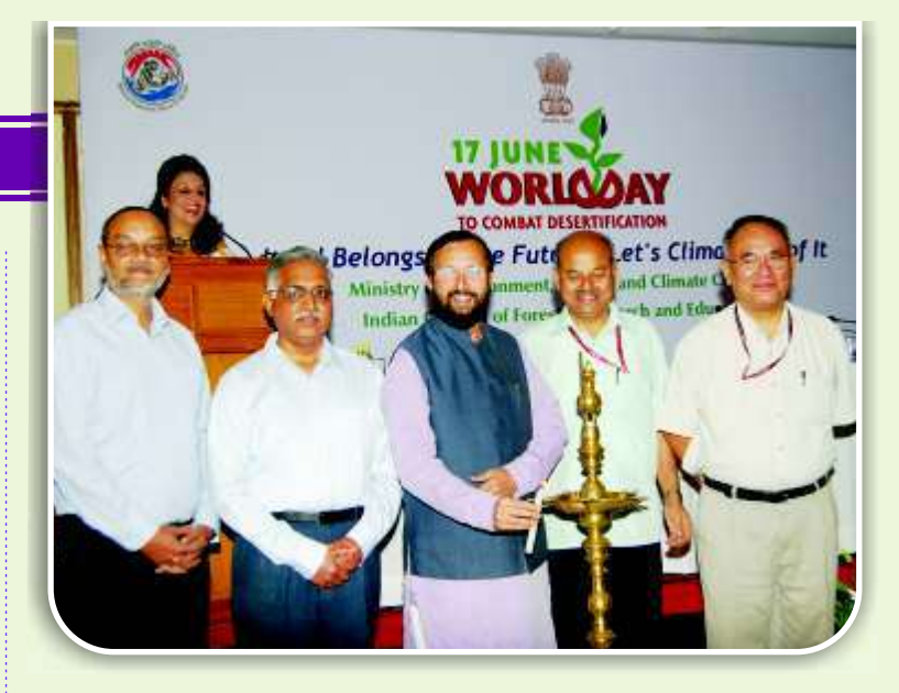
Shri Prakash Javadekar, Hon'ble Minister of Environment, Forests and Climate Change lighting the lamp on the occasion of the World Day to Combat Desertification on 17 June 2014 at New Delhi

On the occasion Hon'ble Minster, MoEF&CC also released a short documentary on Sustainable Land and Ecosystem Management (SLEM) project in India prepared by ICFRE highlighting the SLEM interventions undertaken by the project partners located in different agroecological zones of the country.