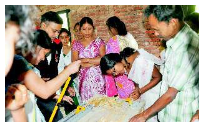
Training on Agarbatti stick making at Jorhat

HFRI, Shimla organized the following training programmes: