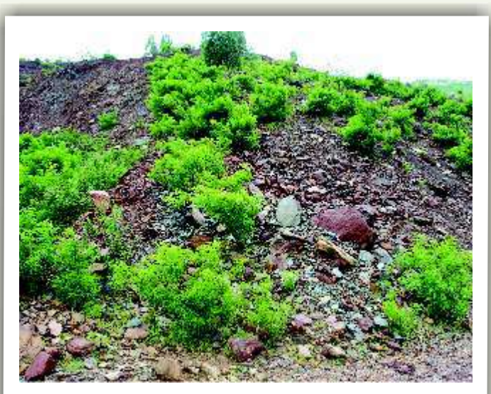
Partially stabilized overburden dump at Banashankari Iron Ore Mine in Bellary district, Karnataka

mines in the mining districts in Karnataka i.e., Bellary, Tumkur and Chitradurga was assigned to ICFRE during March, 2012. Individual R&R plans are being prepared after detailed evaluation of the approved mine plans, existing field operational conditions and keeping in view various environmental parameters for effective adaptive management. During the period under report, thirteen Reclamation and Rehabilitation (R&R) Plans were prepared and approved by Central Empowered Committee (CEC) of the Hon'ble Supreme Court of India. Out of the total ninety three R&R Plans submitted to CEC so far, ninety R&R Plans have been approved by it.