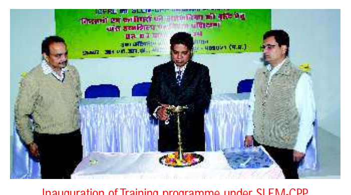
Inauguration of Training programme under SLEM-CPP project at TFRI, Jabalpur

• TFRI, Jabalpur organized specialized training programme on "Bamboo based handicraft for farmers and artisans for livelihood enhancement" from 03 to 07 February 2014 under SLEM-CPP project.