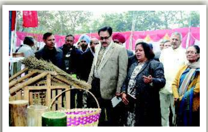
Workshop cum Kissan Mela on "Role of agroforestry in sustainable timber supply to wood based industries" on 13 January 2014 at GBPUAT, Pantnagar