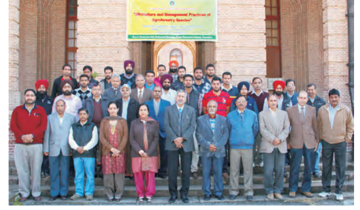
Training for Frontline Staff of Punjab Forest Department