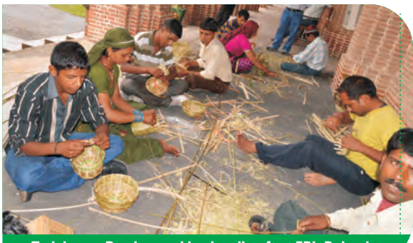
Training on Bamboo making handicraft at FRI, Dehradun

FRI, Dehradun organized a 5 day training on Bamboo handicraft for the farmers/ artisans for states of Uttarakhand and Uttar Pradesh under National Bamboo Mission – BTSG-ICFRE from 15 to 19 January