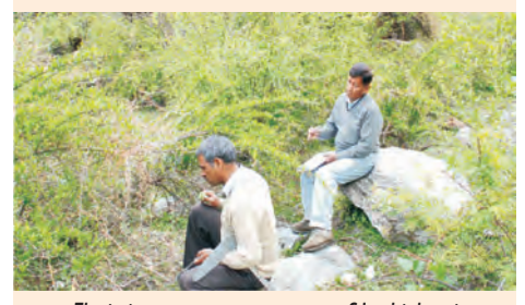
Floristic survey at upstream of Jankichatti Hydro project on Yamuna river

The Project Inception Report of the study has been submitted to Government of Uttarakhand. The study is in progress.