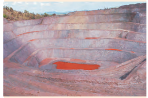
Scientifically mined pit of DRR mines, Chitradurga

for 166 mines in Bellary, Chitradurga and Tumkur