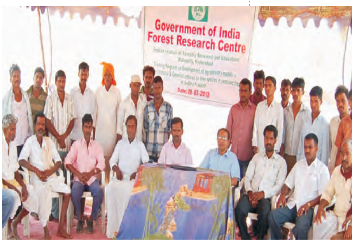
Demonstration cum training on "Development of Agro-forestry models in Wrightia tinctoria and Gmelina arborea as tree species in semi-arid tropics of Andhra Pradesh"

HFRI, Shimla organized a training programme on "Application of technological and Research Interventions for Enhancementof Productivity" at Forest Training Institute, Sunder Nagar which was attended