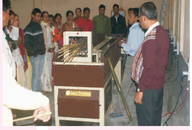
Training on Bamboo Agarbatti Stick Making

RFRI, Jorhat organized a training on bamboo Agarbatti stick making through Public Private Partnership: The first phase of the training commenced at Bamboo Composite Center on 21 January 2013.