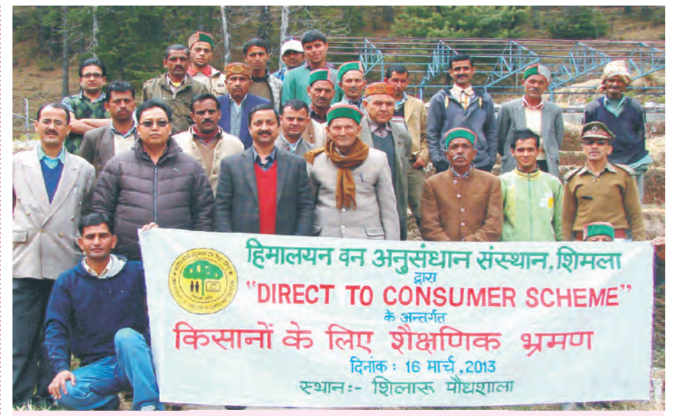
HFRI, Shimla organized 'Exposure Visit'

temperate medicinal plants at Shillaru research nursery of the Institute on 16 March 2013. Twenty farmers from Khatnol (Shimla) and Nichar (Kinnaur) villages of Himachal Pradesh took part in this programme.