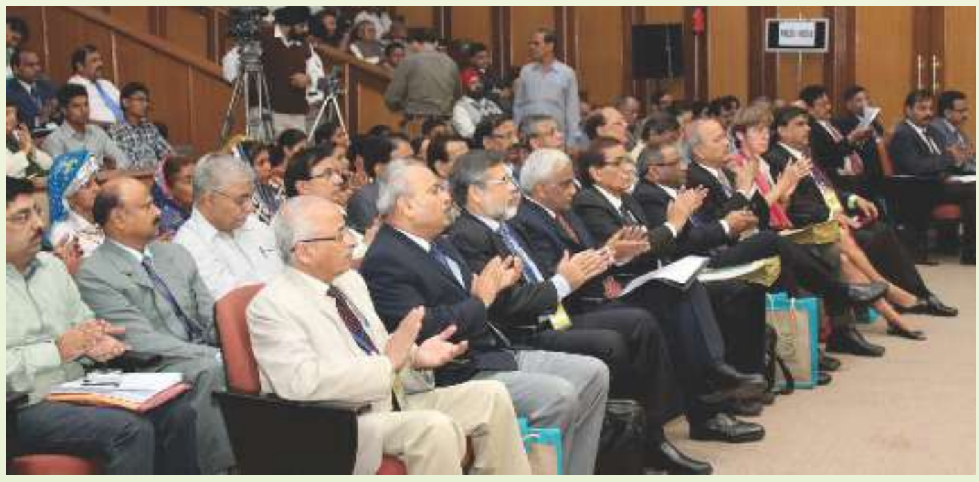
Participants of 1<sup>st</sup> Indian Forest Congress 2011

Over 550 participants from over 50 organizations participated in this gala event which simultaneously held different sessions in 28 sub-themes of 4 themes and the best presentations were awarded. The event concluded with the adoption of New Delhi Forest Charter 2011.