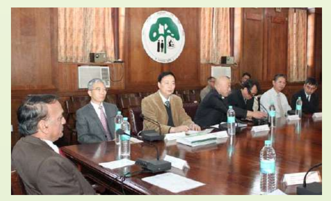
Meeting with Chinese delegation at Dehradun

A six member delegation from Chinese Academy of Forestry paid a return visit to ICFRE, Dehradun on 19<sup>th</sup> December 2011. Opportunities for bilateral cooperation in the area of forestry research between ICFRE and Chinese Academy of Forestry were deliberated, and it was decided to formulate an Umbrella Action Plan under BRICS Cooperation Agreement.