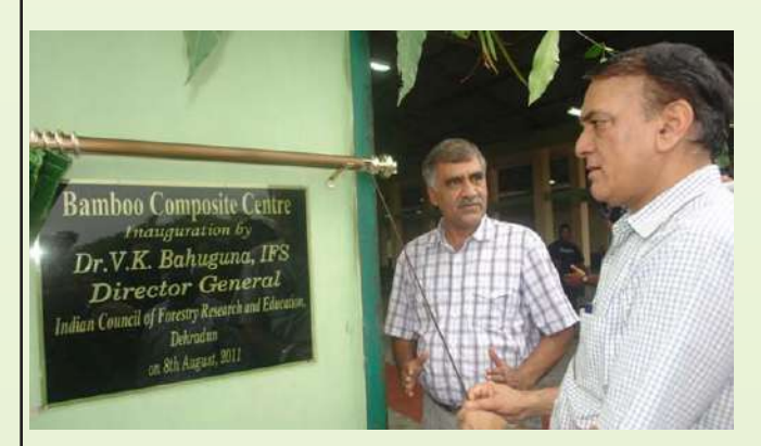
Dr.V.K.Bahuguna inaugurating Bamboo Composite Centre at RFRI, Jorhat

The DG, ICFRE inaugurated Bamboo Composite Centre on 8<sup>th</sup> August 2011 established by RFRI, Jorhat with the technical support from Indian Plywood Industries Research and Training Institute (IPIRTI), Bangalore. The Institute has already procured machinery for processing and production