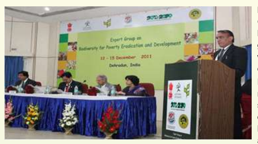
Dr.V.K. Bahuguna, DG, ICFRE, addressing CBD Expert Group Meeting

A four day United Nations Convention on Biological Diversity (CBD) meeting was organized at ICFRE from 12^{th} to 15^{th} December 2011.