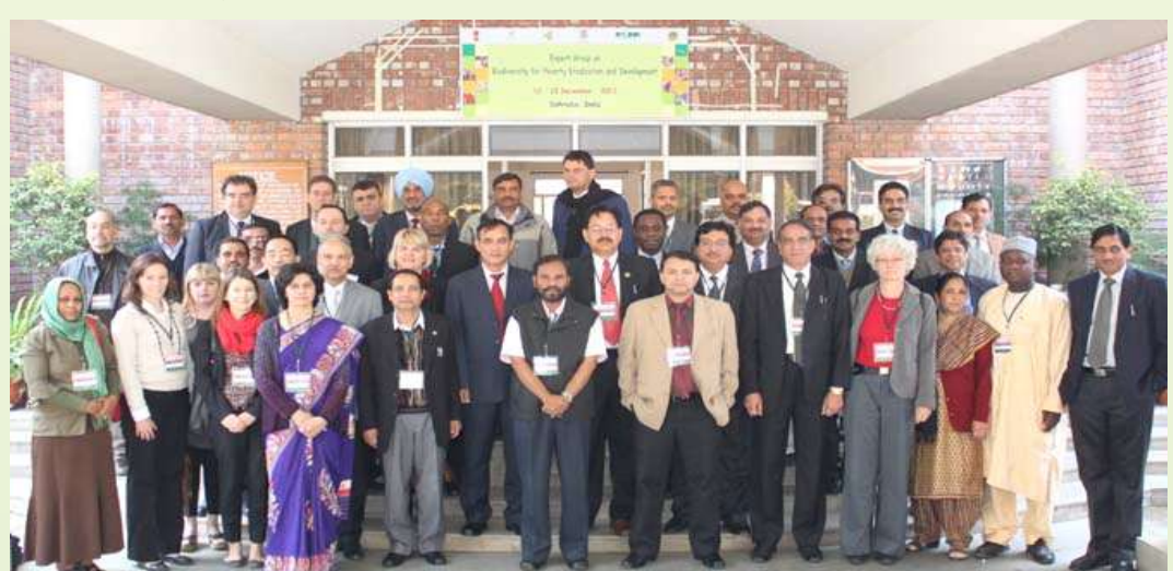
CBD Expert Group Meeting was attended by Expert Group of 17 CBD Country Parties

The CBD Expert Group Meeting was attended by Expert Group of 17 CBD Country Parties; 2 representatives from United Nations andSpecialized Agencies; 7 Inter Governmental Organizations; 9 Non Governmental Organizations; and 3 representatives from Indigenous and Community Organizations, Universities and observers.