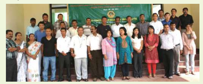
Trainees and resource persons of the training programme under SLEM project at RFRI, Jorhat

RFRI, Jorhat organized workshop cum training on "Sustainable Management of Land Shifting Cultivation under SLEM-CPP" from 6<sup>th</sup> to 8<sup>th</sup> September 2011.