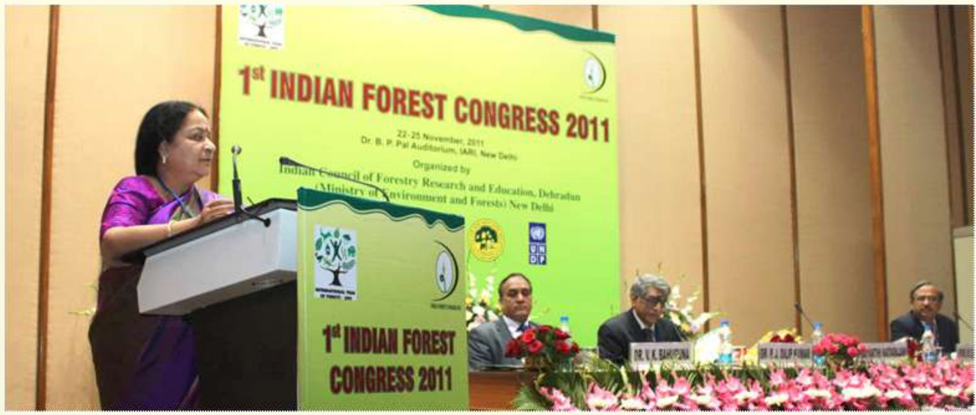
Ms. Jayanthi Natarajan, Hon'ble Union Minister for Environment & Forests, addressing the inaugural session of IFC 2011

The Indian Council of Forestry Research and Education organized First Indian Forest Congress (IFC) from 22<sup>nd</sup> to 25<sup>th</sup> November 2011. The IFC was inaugurated by Ms. Jayanthi Natarajan, Hon'ble Minister of Environment & Forests in New Delhi. Ms. Jayanthi Natarajan, in her inaugural address called for more scientific analysis of the issues relating to forest management in the country, in the midst of ever burgeoning pressure on the forests and climate change threat.