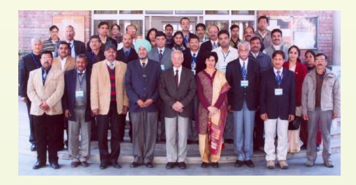
Participants and organizers of two days workshop for finalization of DST training programme

ICFRE, Dehradun organized two days workshop for finalization of DST training programme from 28<sup>th</sup> to 29<sup>th</sup> January 2011. Thirty two participants from different national institutes and organization participated in the workshop.