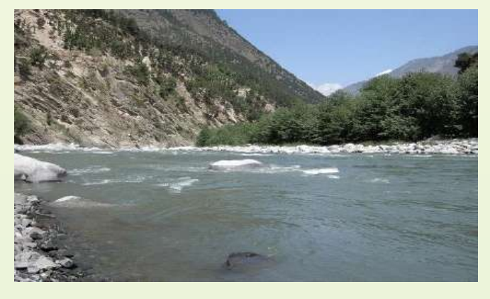
Catchment Area of river Ravi, HP

Team of experts visited the project site for winter and Pre-monsoon season for the collection of baseline data terrestrial and aquatic flora,fauna and microflora.