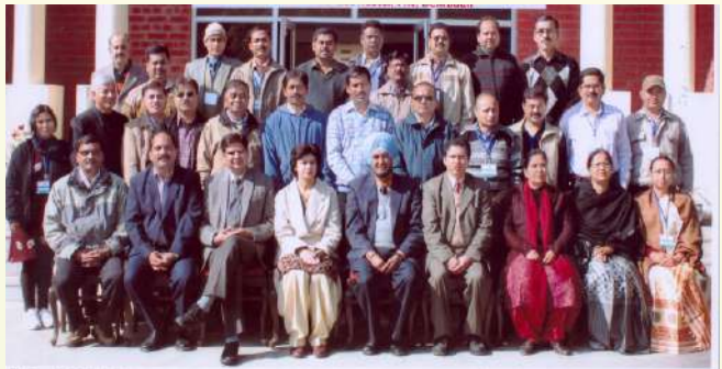
Participants and organizers of one week training course for ICFRE scientists

January to 4<sup>th</sup> February 2011. Twenty scientists from different ICFRE institutes participated in the course.