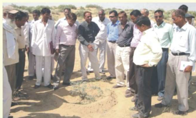
VVK training participants visiting Prosopis cineraria plantation in SDS, Ranisar, IGNP area, Bikaner

AFRI, Jodhpur organized a three days training under VVK at Kisaan Bhawan, Bikaner from 4 th to 6 th October 2010. Total 41 participants (36 forest staffs and 5 farmers) attended the training. The training included techniques of conservation and economic benefits of agroforestry; cultivation of arid fruit trees and production, nursery techniques for cutting, grafting and high quality seed production, use of biofertilizers and organic and compost manure manufacturing techniques etc. Training course consisted of both, lectures and field demonstrations.