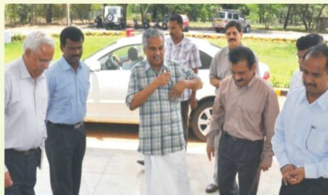
Shri Binoy Visham, Hon'ble Minister for Forests and Housing, Kerala at IFGTB, Coimbatore

Shri Binoy Visham, Hon'ble Minister for Forests and Housing, Government of Kerala visited IFGTB, Coimbatore on 2 nd September 2010 and interacted with the officers and scientists.