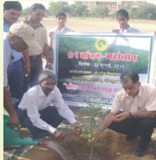
Van Mahotsav at Jodhpur

AFRI, Jodhpur celebrated "Van Mahotsav" at Kendriya Vidyalaya No. 2, Sikargarh Army Area Jodhpur on 23 rd July 2010. Around 150 seedlings of various shade trees were planted by the teachers and students in the school campus.