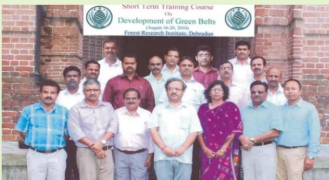
Participants of short term training course on Development of Green Belts at FRI, Dehradun

FRI, Dehradun organized a short term training course on "Development of Green Belts" from 16 th to 20 th August 2010.