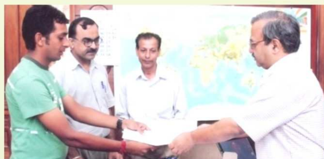
Director, FRI, Dehradun handing over the papers of technology transfer

Technical Knowhow for "Reshaping the Gums" developed by FRI, Dehradun was transferred to M/s R.S. Food Processes (I) Pvt. Ltd., Rajnandgaon, Chhattisgarh on 12 th August 2010 and to M/s Rajput Enterprises Pvt. Ltd., Bhopal on 15 th December 2010.