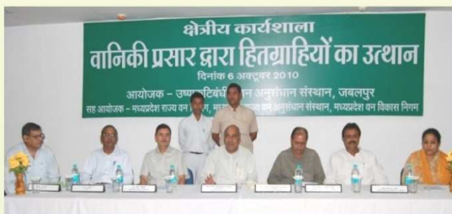
Workshop on "Upliftment of Stakeholders through Forestry Extension" at TFRI, Jabalpur

TFRI, Jabalpur organized a workshop on "Upliftment of Stakeholders through Forestry Extension" on 6 th October 2010.