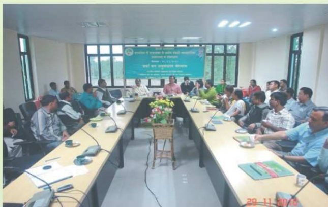
Workshop on "Problem & Solutions Regarding the Implementation of Official Language in Office" at RFRI, Jorhat

RFRI, Jorhat organized a workshop in Hindi on the topic "Problems & Solutions Regarding the Implementation of Official Language in Office" on