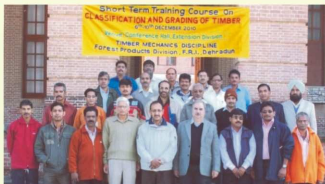
Participants of short term training course on "Classification and Grading of Timber" at FRI, Dehradun

Shimla, Garden Reach Shipbuilders & Engineers Ltd., Kolkata participated.