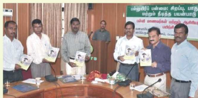
Training programme on "Importance of Biodiversity its Conservation and Sustainable Utilization" at IFGTB, Coimbatore

Conservation, and Sustainable Utilization" for school students and teachers of Coimbatore, Tirupur, Pollachi, Erode and Gopichettipalayam educational districts of Tamil Nadu, during the month of August 2010 in which 120 participants attended. The training was sponsored by Department of Environment, Government of Tamil Nadu.