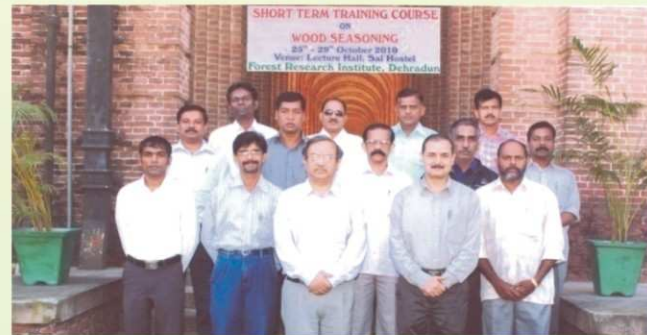
Participants of short term training course on "Wood Seasoning" at FRI, Dehradun

FRI, Dehradun organized a short term training course on "Wood Seasoning" from 25 th to 29 th October 2010 in which 12 participants from Naval Dockyard, Mumbai and Naval Ship Repairing Yard, Kochi participated.