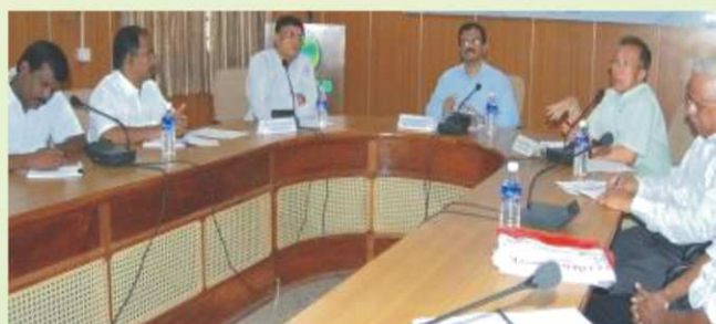
Training workshops on "Production of Genetically Improved Seeds and Modern Nursery Techniques" at IFGTB, Coimbatore

IFGTB, Coimbatore organized a two training workshops for foresters and farmers on "Production of Genetically Improved Seeds and Modern Nursery Techniques" on 12 th and 13 th August 2010. Extension Officers from Tamil Nadu Forest Department, Agricultural Officers from Puducherry Forest Department, nursery managers of wood based industries and farmers participated in the training workshop.