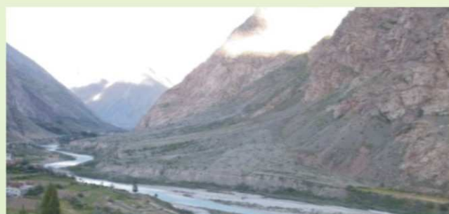
Gyspa HEP site, Himachal Pradesh