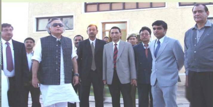
Shri Jairam Ramesh, Hon'ble Minister of Environment and Forests, Government of India interacting with other dignitaries on the occasion of inauguration of CDFRS, Leh