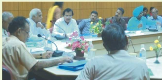
A meeting-cum-workshop on coordinated project on Khejri at AFRI, Jodhpur

AFRI, Jodhpur organized a meeting cum workshop on coordinated project titled "Integrated Management of Khejri ( Prosopis cineraria ) Mortality for Socio-economic Upliftment in Rajasthan" from 21 st to 23 rd August 2010 at the institute. A visit to severely affected area of Khejri mortality in Nagaur district was conducted on 22 th August 2010.