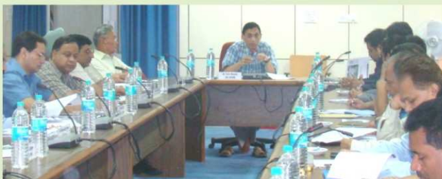
Training programme on "CDM Validation and Verification" at ICFRE, Dehradun

ICFRE facilitated a five days training course on "CDM Validation and Verification" was organized by M/S TUV SUD South Asia Pvt. Ltd. New Delhi at Dehradun, from 9 th to 13 th August 2010. Twenty officers and scientists of ICFRE (Hqr) and FRI participated.