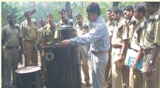
Training Programme on model nursery practices for sandal and macro and micro propagation techniques VVK, Goa

preservation techniques i.e., sap displacement and boucherie process were demonstrated.