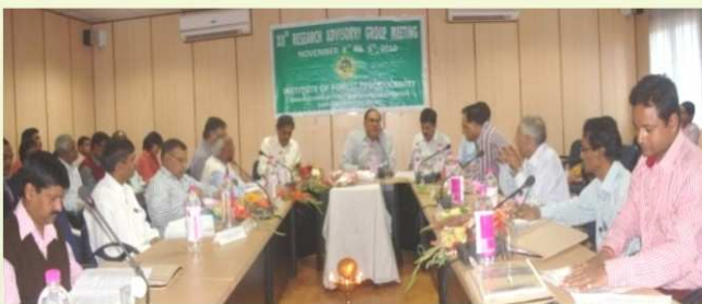
IFP, Ranchi Organizing XII RAG Meeting