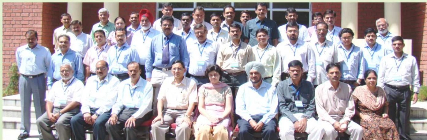
Participants and organisers of training on Climate Change and Carbon Mitigation

One week training programme was organized for scientists and technologists on "Climate Change and Carbon Mitigation" by the Biodiversity and Climate Change Division at ICFRE, Dehradun from 6 th to 10 th September 2010. Twenty six scientists and technologists participated in the programme. The training programme was sponsored by the Department of Science and Technology, Government of India, New Delhi.