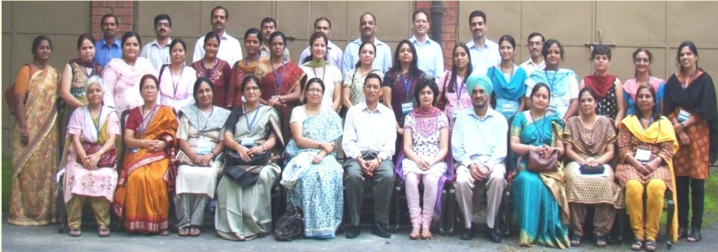
Participants and organizers of training for women scientists and technologists

One week training programme for women scientists and technologists on "Climate Change and Carbon Mitigation" was organized by the Biodiversity and Climate Change Division at ICFRE, Dehradun from 4 th to 8 th October 2010. Twenty two women scientists and technologists participated in the programme. The training programme was sponsored by the Department of Science and Technology, Government of India, New Delhi.