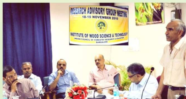
Research Advisory Group Meeting at IWST, Bangalore