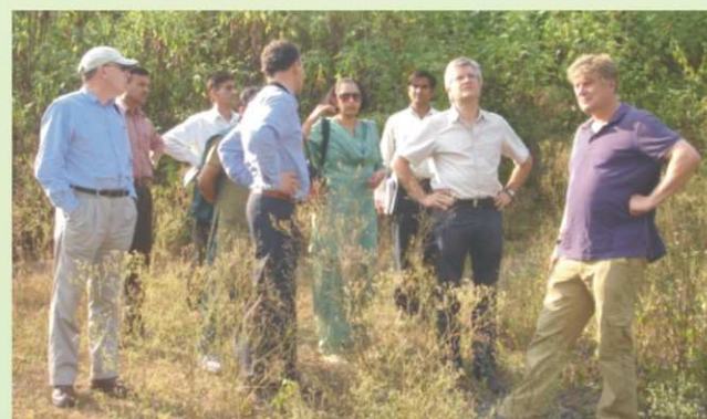
UK Forestry Commission team Visiting Mined Restoration Site at Maldeota, Dehradun

The team appreciated the diverse and innovative efforts being undertaken in different parts of India for restoring different topological sites by effectively involving the local people. It was agreed in principle by UKFC to provide financial support to this project. The first phase will lead to the documentation of Forest Landscape Restoration efforts being undertaken in different parts of our country, with specific details from the states of Uttarakhand, Madhya Pradesh and Orissa.