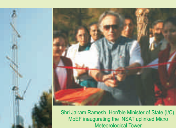
MoEF inaugurating the INSAT uplinked Micro

The Hon'ble Union Minister for Environment & Forests, Shri Jairam Ramesh inaugurated the INSAT uplinked Micro Meteorological Tower in Forest Research Institute on 10<sup>th</sup> January 2010. The tower, 13 meter high and a part of FRI-ISRO Climate change study programme, will gauge and model the physical and biological process controlling mass and energy exchange between tree canopy and the atmosphere.