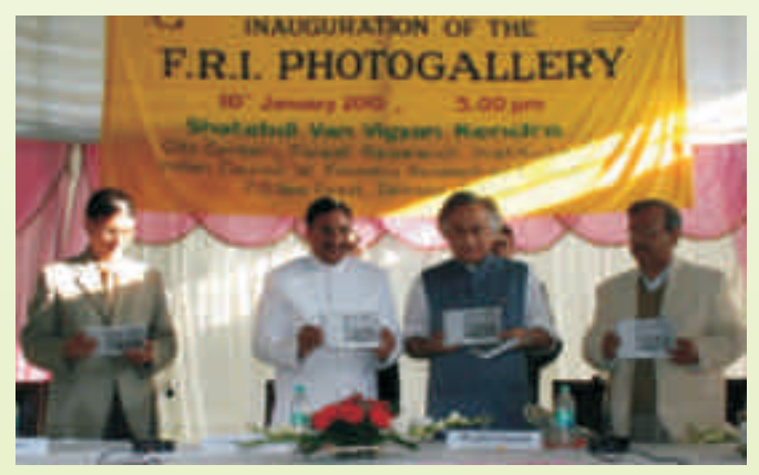
Shri Jairam Ramesh, Hon'ble Minister of State (I/C), MoEF inaugurating FRI Photogallery

The Hon'ble Union Minister for Environment & Forests. Shri Jairam Ramesh inaugurated the Photogallery established by Forest Research Institute, Dehradun at Shatabdi Van Vigyan Kendra, Dehradun on 10<sup>th</sup> January 2010. He along with Dr. Ramesh Pokhriyal 'Nishank', Hon'ble Chief Minister of Uttarakhand released a booklet