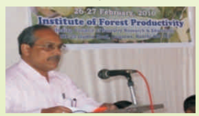
Inception Training Workshop under the project "Estimates of Kendu Leaves Production in Jharkhand"

IFP, Ranchi organized 3<sup>rd</sup> meeting of State Level Monitoring Committee (SLMC) constituted to review and monitor the progress of the Gol-UNDP CCF-II project on "Biodiversity Conservation through Community based Natural Resource Management" in the State of