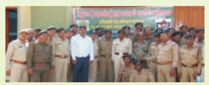
Training on "Integrated development of Jatropha and Karanj" to the forest officials of M.P.

TFRI , Jabalpur organized training on "Integrated development of Jatropha and Karanj" for the forest officials of M.P. on 10<sup>th</sup> and 11<sup>th</sup> March 2010 and for farmers on 8<sup>th</sup> to 9<sup>th</sup> March 2010 at Indore (M.P).