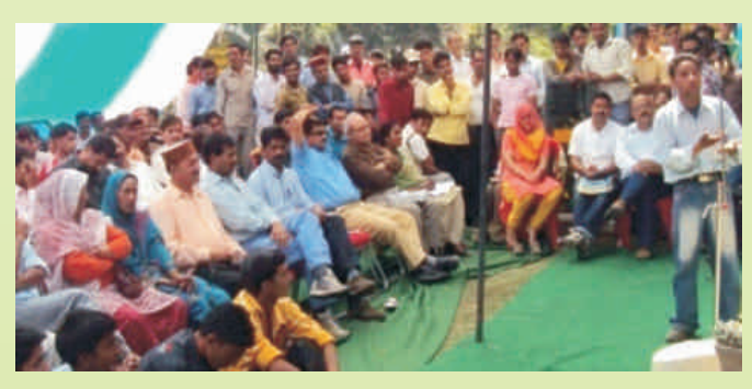
Public consultation in progress for Kuther, HEP Chamba, Himachal Pradesh

Himachal Pradesh State Pollution Control Board conducted a two-days public hearing for Kuther Hydroelectric Power Project at Chamba District of Himachal Pradesh on 16<sup>th</sup> April 2010 at Dalli Village and on 17<sup>th</sup> April 2010 at Garola village. The meeting was attended by District Magistrate, Sub-divisional Magistrate, Director (Environment, S&T), Department of Environment; Chairman, Zilla Parishad, Chamba District, The Engineer-in-chief (PWD), US-Club, Shimla; The Engineer-in-chief (I&PH), US-Club, Shimla; The Director, Fisheries Deptt., Bilaspur; Forest officers, State Forest Department; JSW the project proponent and EIA consultants from ICFRE and HFRI. A presentation was made by ICFRE on the baseline status of the project and the management plan proposed to overcome the negative impact on physical, biological and social environmental. A detailed plan proposed for tribal area