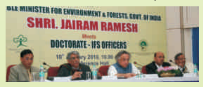
An interactive meeting with Doctorate IFS Officers

An interactive meeting of Doctorate IFS Officers with the Hon'ble Minister of Environment and Forests, Govt. of India Shri Jairam Ramesh was organized on