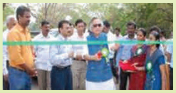
Shri Jairam Ramesh, Hon'ble Minister of State (I/C), MoEF inaugurating Tree Growers' Mela

Institute of Forest Genetics and Tree Breeding (IFGTB), Coimbatore organised a Tree Growers' Mela on 18th and 19th February 2010 at Coimbatore. The Mela