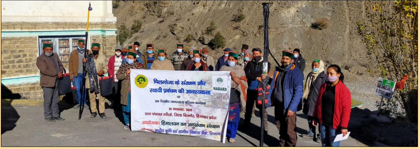
Training on चिलगोजा के संरक्षण और इस के स्थायी प्रबंधन की आवश्यकता

Farmers of Dubling Panchyat, of Pooh Forest Range, Kinnaur and farmers of Spillow Panchyat, of Pooh Forest Range, Kinnaur