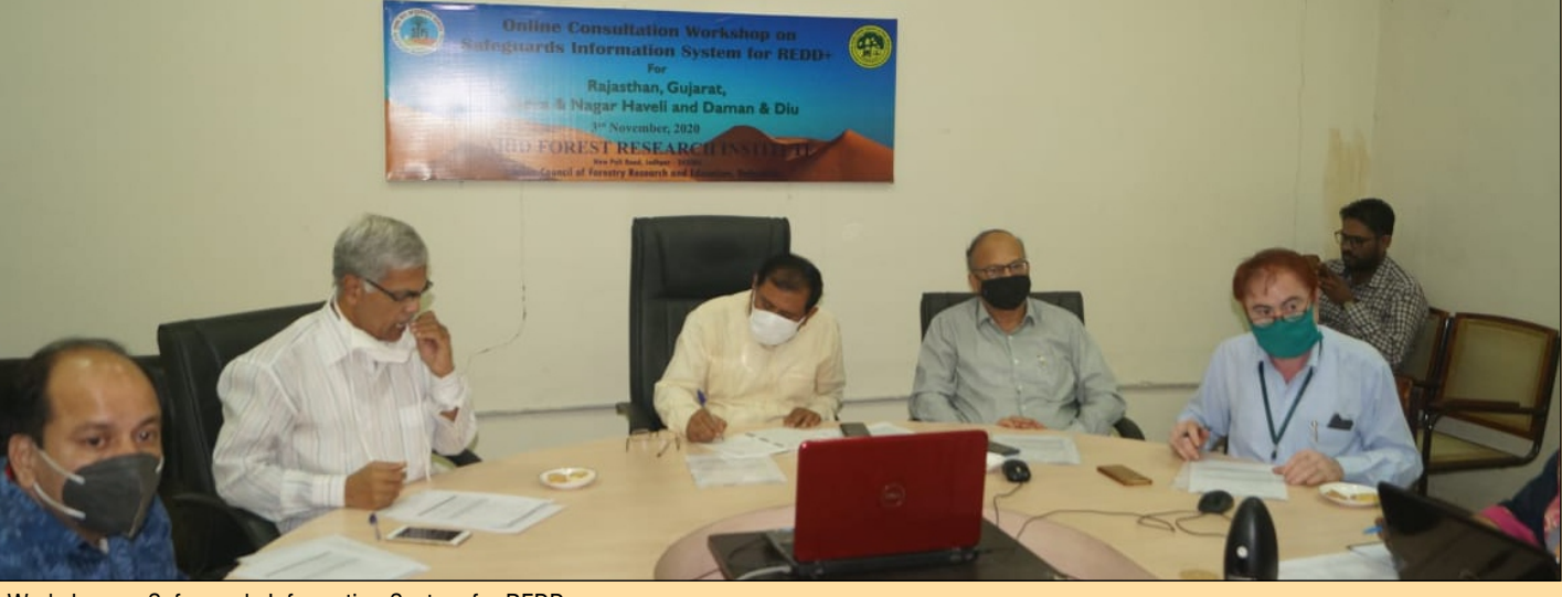
Workshop on Safeguards Information System for REDD+