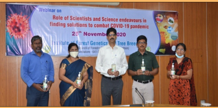
Release of IFGTB's Herbal Hand Sanitizer

IFGTB formulated Herbal Hand Sanitizer using the leaf extracts of Eucalyptus globulus (eucalyptus), Plectranthus Amboinicus (Karpuravalli), Lantana camara and Cymbopogon citratus (lemon grass) plants enriched with phytochemical having significant antimicrobial activities in equal proportions along with isopropyl alcohol, water and glycerol which kills maximum (90-99%) of germs. The hand sanitizer is natural, harmless and safe to skin and keeps the hands soft and refreshed. Trade mark application for IFGTB's Herbal Hand Sanitizer has been submitted. The product was released on 25 November 2020 in the seminar "Role of Scientists and Science endeavours in finding solutions to combat COVID-19 pandemic".