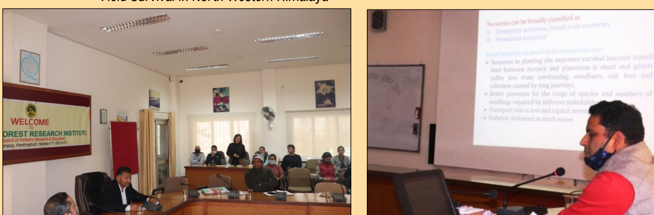
Seminar on Application of Modern Nursery Techniques in Forestry for Production of Quality Planting Stock and Enhancement of Field Survival in North Western Himalaya