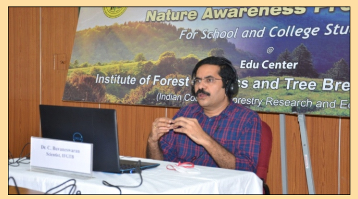
IFGTB, Coimbatore organized online knowledge series on Forest and Climate Change