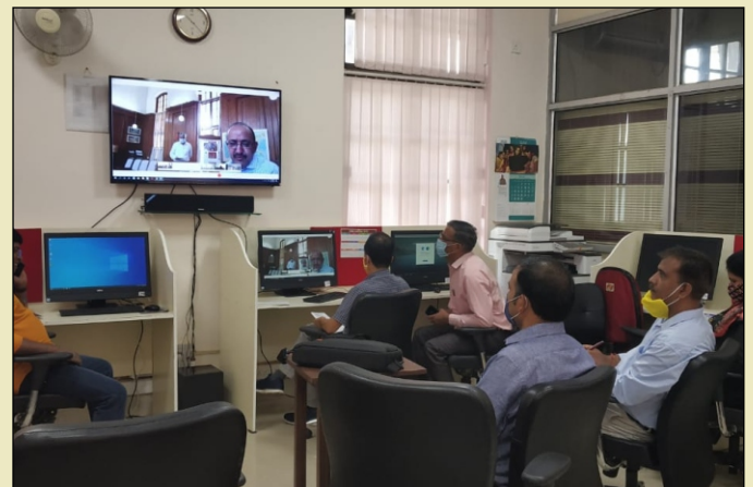
Webinar on Safeguards Information system for REDD+