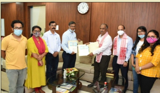
MoU signed between RFRI, Jorhat and NEIST, Jorhat