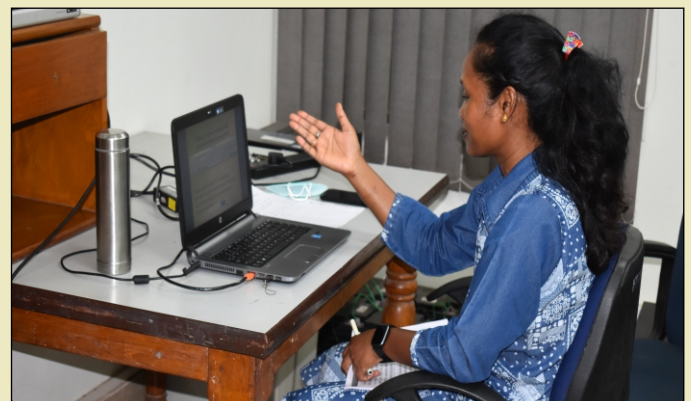
Training on Computer Application