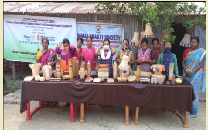
Training on Value addition in Bamboo Product for Community Enterprise Development