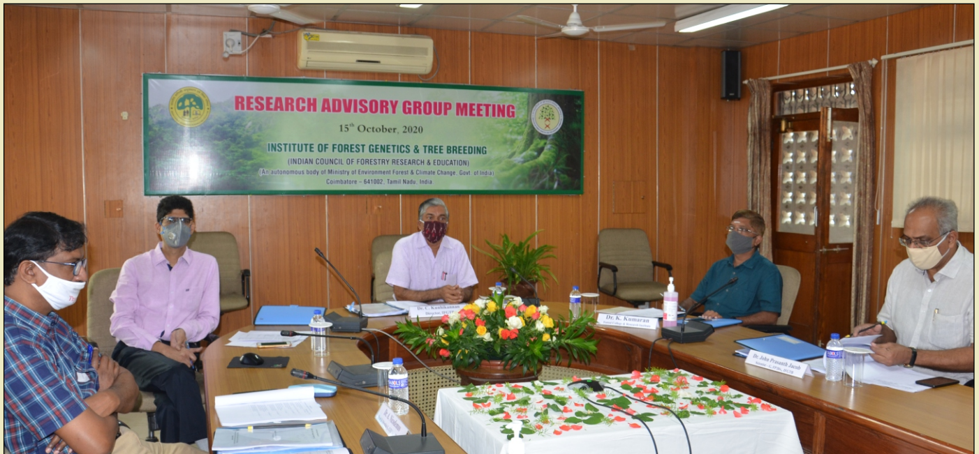
Research Advisory Group Meeting at IFGTB, Coimbatore