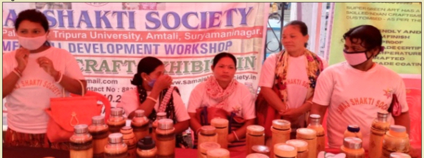
FRCLE, Agartala organized exhibition in collaboration with Rotary Club of Agartala and Samaj Shakti Society, Agartala