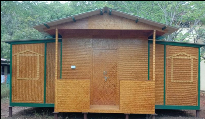
Product Sale Counter

Established Product sale counter at IFGTB, Coimbatore as part of the NRDMS (DST-8) sponsored project on “Development of compost out of waste for livelihood support to Tribes in Tamil Nadu: a part of Swachh Bharat Mission”.