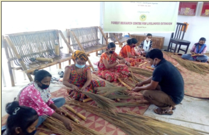
Training on Designing and Production of Plastic Free Broom