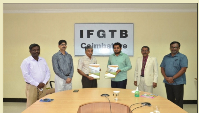
MoU signed between IFGTB, Coimbatore and Musiri Institute of Technology (MIT-CAT)