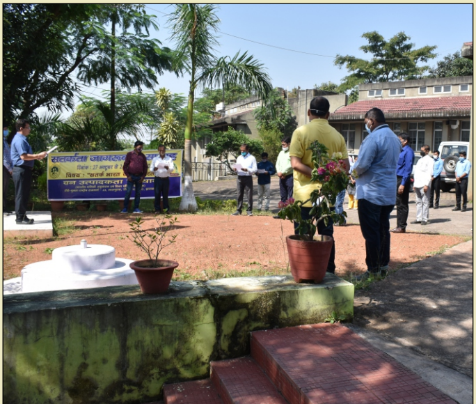
Vigilance Awareness Week observed at IFP, Ranchi