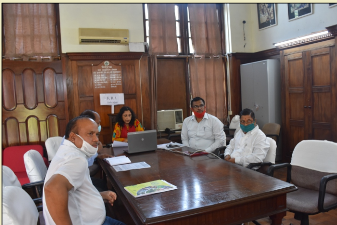
Webinar on Sustainable harvesting and Utilization of Non Timber Forest Products for livelihood generation