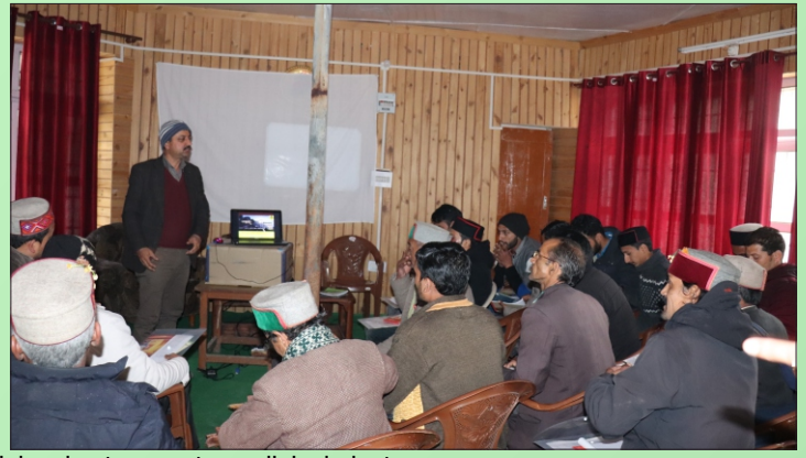
Training on cultivation of important high value temperate medicinal plants