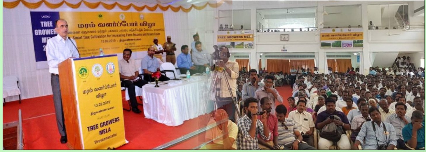
Tree Growers Mela at Tiruvannamalai, Coimbatore