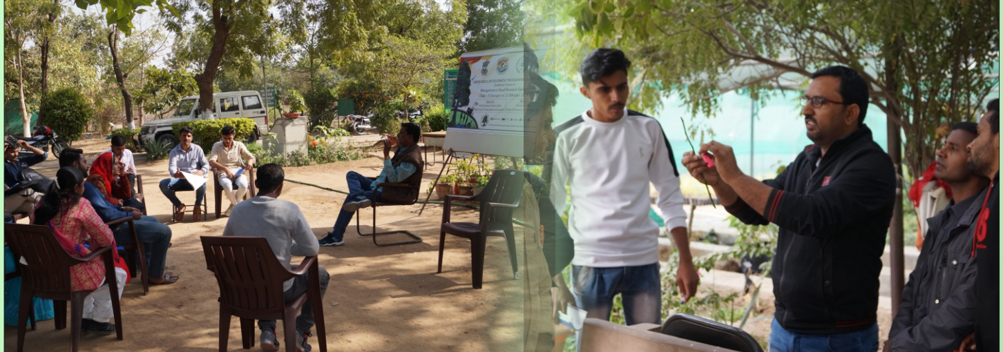
Training on Management of Small Botanical Gardens