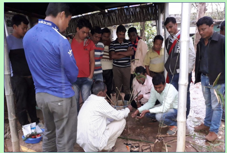
Training on Development and Management of Bamboo Kisan Nurseries