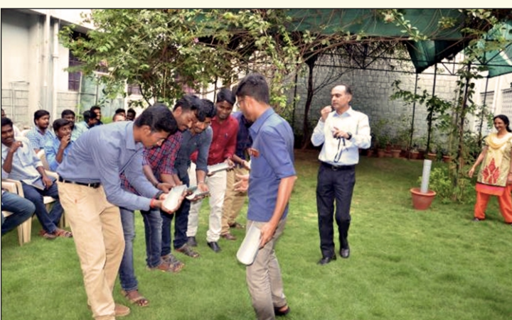
Research Scholar Monthly seminar