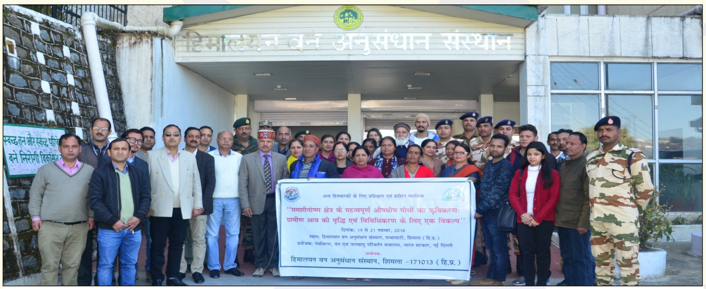
Training on Cultivation of Important Temperate Medicinal Plants: an option for Diversification and Augmentation of Rural Income

Ward members, Mahila Mandals, Eco-Task Force, Gardeners from ITBP, Teachers, NGO's, Media Persons, Panchayat Secretary and officials of BDO Office