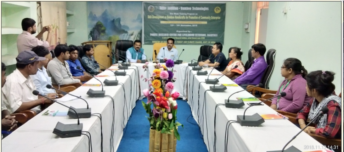
Training on "Skill Development on Bamboo Handicrafts for Promotion of Community Enterprise" at FRC-LE, Agartala

Processing, Preservation & Artisan Work for construction of Bamboo 12. House and related Application