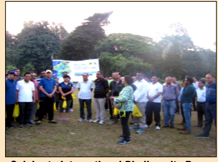
Celebrate International Biodiversity Day at FRI, Dehrdun