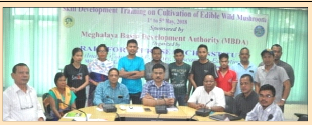
Training on Wild Edible Mushroom Cultivation at RFRI, Jorhat