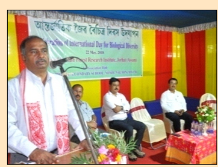
Celebrate International Biodiversity Day at RFRI, Jorhat