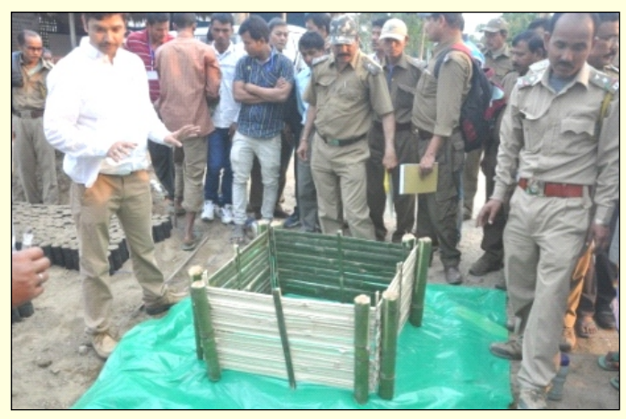
Training on Bamboo Cultivation, Propagation technique and Nursery Management