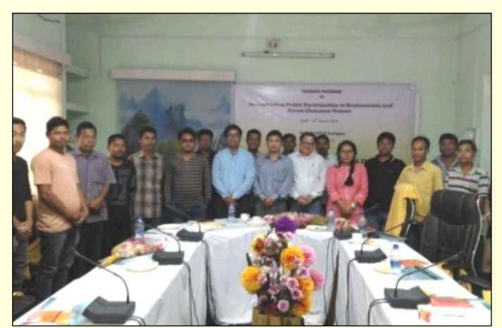
Training on Strengthening Public Participation in Environment and Forest Clearance Process