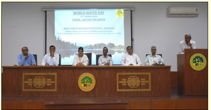
World Water Day 2018 at AFRI, Jodhpur