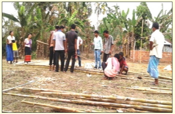
Training on Bamboo preservation, joints and joinery Techniques & tress making