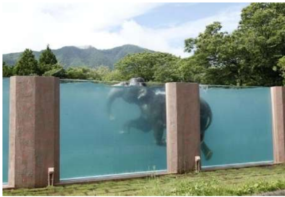
An Asian elephant swims in a 65-meter-long pool at Fuji Safari Park in Susono, at the foot of Mt. Fuji, Japan.

forest areas, where there are swamps, and everything in between. They form emigrational paths that they continue to follow year after year. This allows them to take advantage of the foods that grow in various areas. The paths that they walk are clearly there just like a road and they are fascinating to see when you are looking at areas that don't have any clear pathways other than these from the elephants as they roam around.