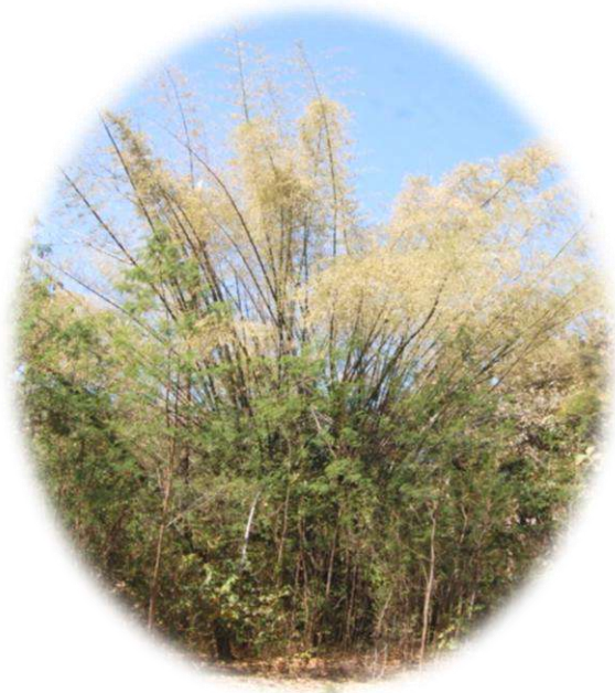
पुष्पनयुक्त बांस का भिर्रा

बांस मानव के जीवकोपार्जन के प्राकृतिक उपहारों में से एक है। यह घास प्रजाति का सदस्य है जो प्राचीन समय से मनुष्य की विभिन्न आवश्यकताओं की पूर्ति करता आया है तथा समय के साथ-साथ मनुष्य ने बांस के विविध तरह से उपयोग कर इसकी उपयोगिता को बढ़ाया है। बांस का उपयोग मनुष्य, बांध, वाद्ययंत्र, घर बनाने तथा खाद्य पदार्थ के रूप में करता है। बांस में फल व फूल काफी समय बाद आते हैं जो प्रजाति के अनुसार इनका समयकाल हर प्रजाति के बांस में अलग-अलग होता है।