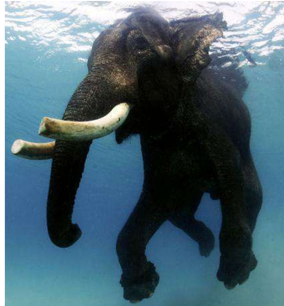
The last swimming elephant in the Andaman Islands, India

driving away of elephants, early-warning systems to forewarn of potential encounters, land-use planning, and various other ways of working with local communities so that they can continue to live side-by-side with elephants.