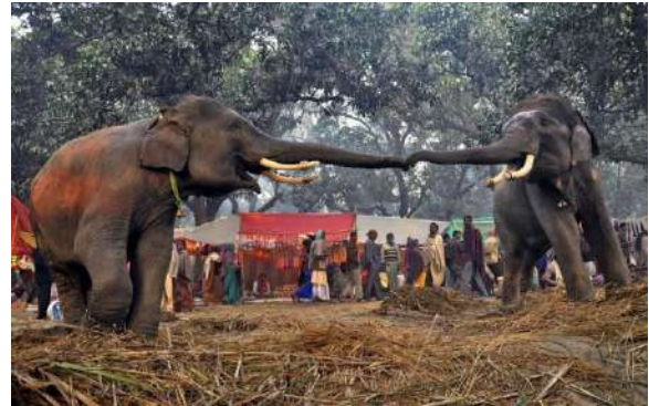
Two elephants reach out to each other at the Sonepur Cattle Fair in the Saran district of Bihar on November 28, 2012.

goals that numerous elephant conservation organizations are focusing on around the world.