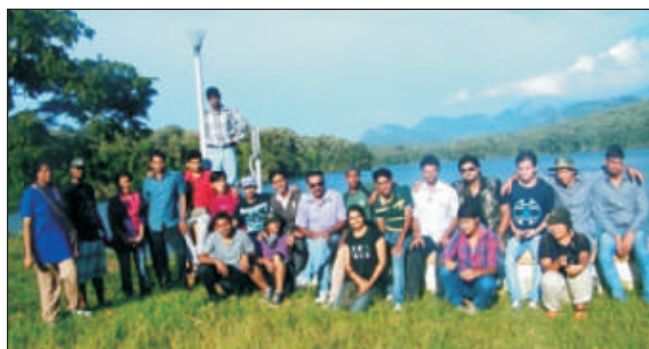
Students during the visit to South India

Technology and Cellulose and Paper Technology.