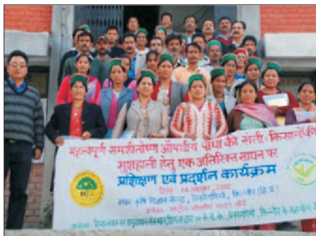
Participants and organizers of training-cum- demonstration programme on medicinal plants at HFRI, Shimla

Management, Development of Green Belts, Artificial cultivation of Cordyceps sinensis (Yarsha Gumba), Various aspects of CITES, NWFP value addition, processing and marketing, Bio-fertilizers and bio-pesticides, Diseases and their control measures in forest nurseries and plantations, vermi-compost, Reclamation and revegetation of mined overburden dumps, Scientific Methods of Lac Cultivation, Significance and Scope of REDD / REDD+ for India's Forests and Climate Change and Carbon Mitigation etc. were organized by ICFRE Hqs. and its institutes are as follows: