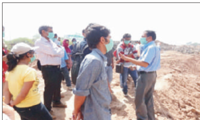
Student of M.Sc. EM during the tour to Baddi