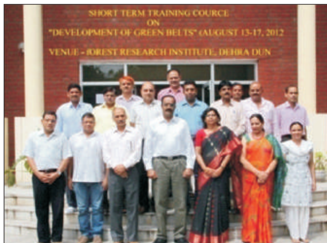
Participants and organizers of short-term training course on Development of Green Belts at FRI, Dehradun